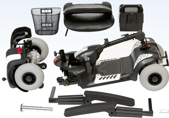
SPLITS EASILY FOR TRANSPORTATION & STORAGE

The Prism Sport is ideal for use indoors and outdoors where the terrain is forgiving (eg. smooth paths, shopping centres, etc). The Prism carries the Mercury brand, this ensures a focus on Comfort, Style, Performance and Reliability.