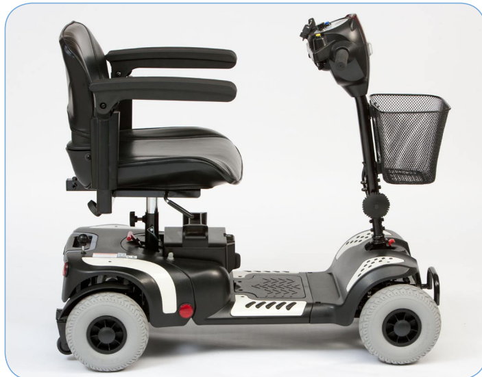
INCREASED GROUND CLEARANCE