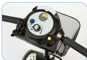
LED BATTERY GAUGE