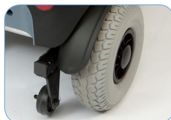
NEW MUD FLAPS