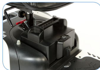
NEW 20AH BATTERY PACK